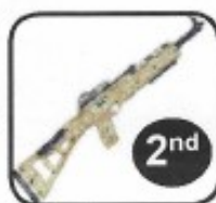
Hi-Point 4595TS Desert Digi Camo 45ACP Rifle